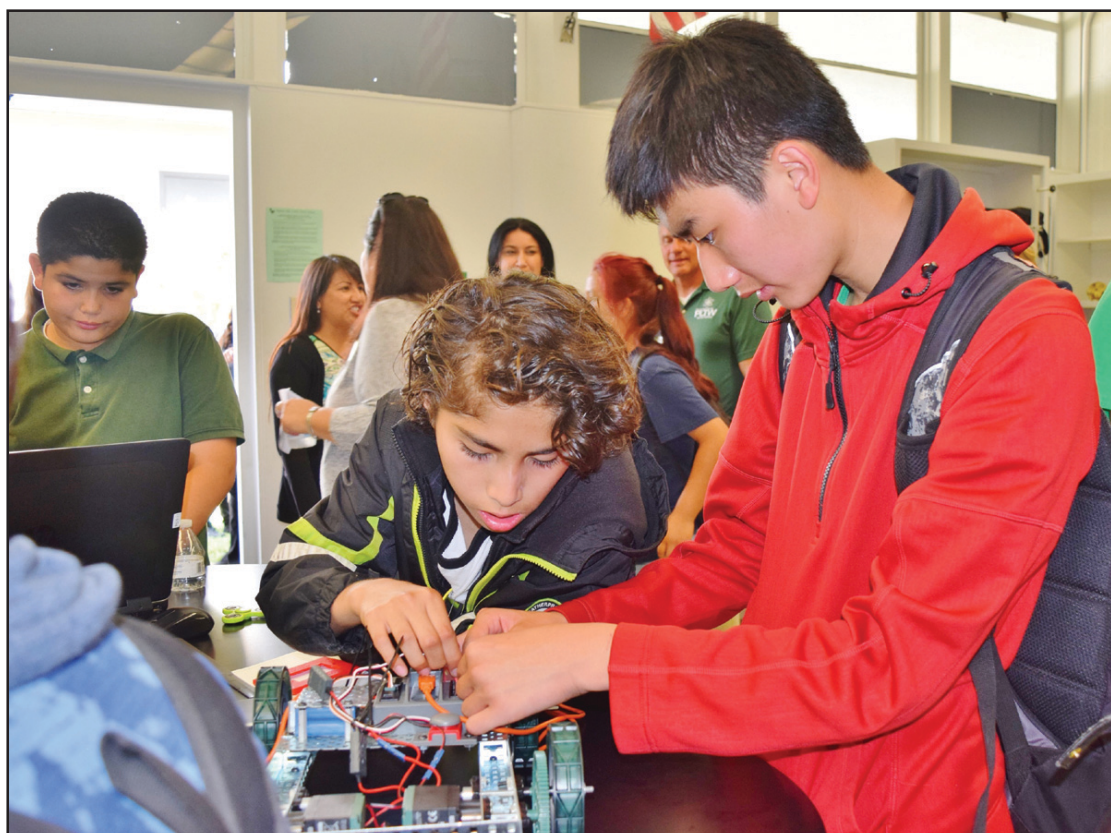
STEM students from Baldwin Park Unified's Holland Middle School adjust wires on their robotic car during a grand-opening celebration of two STEM labs on May 5. Partnered with Project Lead The Way, the District created new labs to accommodate courses in engineering design and modeling, and automation and robotics.

School transforms 1950s classrooms into modern tech labs