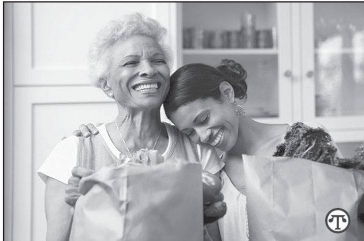
Your risk for broken bones due to osteoporosis rises with age, but planning ahead for long-term care can help you protect your independence.

If you are 50 years old or older, it may be a good idea to speak with your health care professional about your chances of getting this disease. Your doctor may want to evaluate your risk factors by asking about your diet, height and weight, lifestyle, family