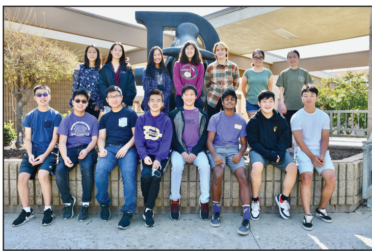
Fifteen Diamond Bar High School seniors have been named 2022 National Merit Scholarship semifinalists.

Students must also write an essay and be recommended by a high school official.