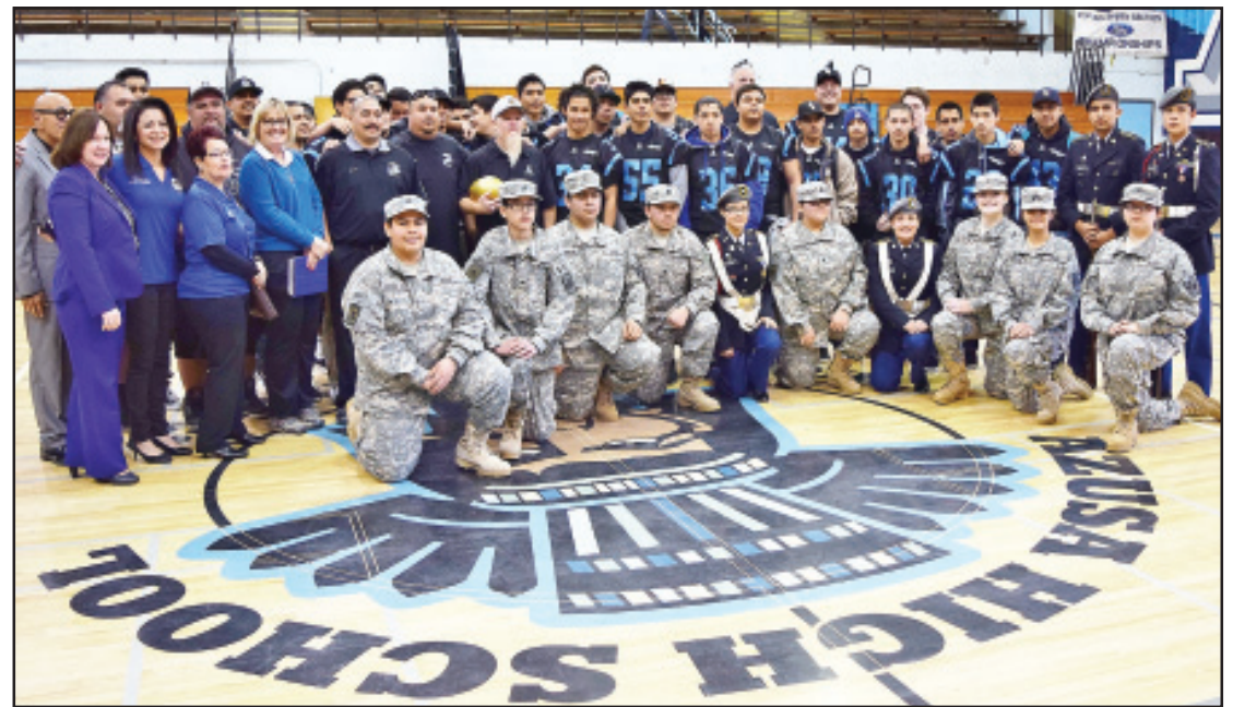
Azusa Unified School District and City of Azusa officials and Azusa High School football team, JROTC, staff and administrators pose with the commemorative Wilson Golden Football, in honor of native Azusan Billy Kilmer, who played as quarterback for the Washington Redskins at Super Bowl VII.