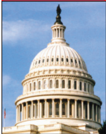
"Fight the Bite" / 3