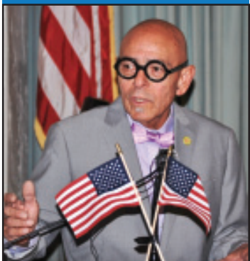
Azusa Mayor Joe Rocha / 15