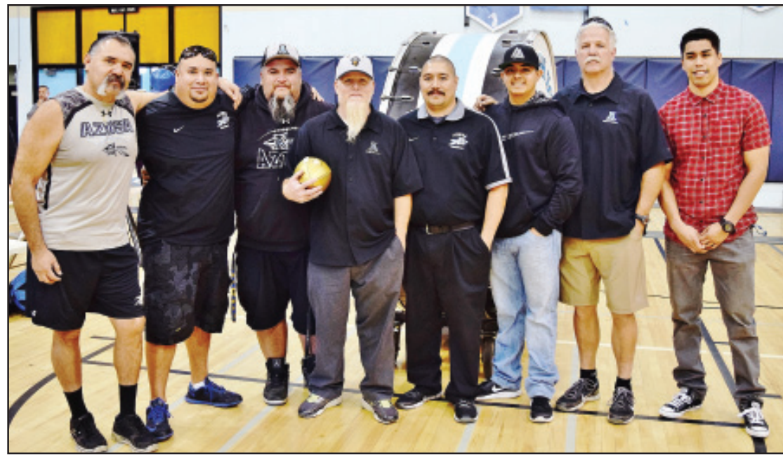
The Azusa High School coaching team with the commemorative Wilson Golden Football. The NFL Foundation will provide the schools with a new character education curriculum and the opportunity to apply for grants of up to $5,000 to help support and grow their football programs.