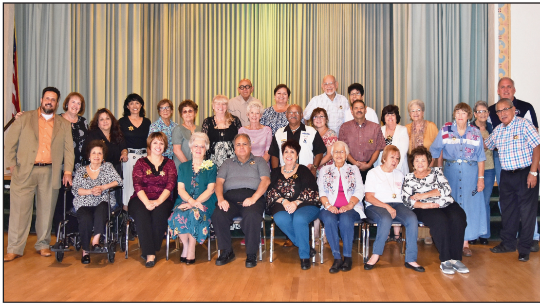
Current and Past Azusa Golden Days Honored Citizens are celebrated annually with a lunch at the Azusa Woman's Club, this year catered by California Grill Express of Azusa.

Azusa Golden Days is a weeklong celebration comprised of events sponsored by a variety of civic and business organizations. Annually it starts on the first Saturday in October and ends the second Sunday in October. This year it started on Satur-