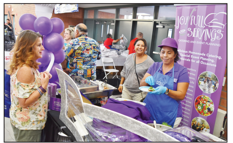
The Azusa Chamber of Commerce Golden Days Taste of the Town held at the Azusa National Guard Armory gathered nearly thirty restaurants, including Azusa's new Catering and Event Planning business, "Joy-Full Servings"