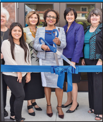
Citrus College Hayden Hall / A7