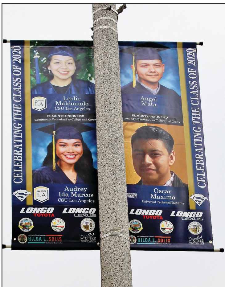
El Monte, Rosemead and South El Monte High School banners honor the Class of 2020 graduates at locations throughout each school's local communities.

"On behalf of our students and families, I want to thank