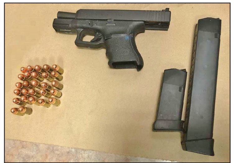
Covina Police posted this picture of the recovered weapon.

Police recovered the weapon and it will be checked for finger-