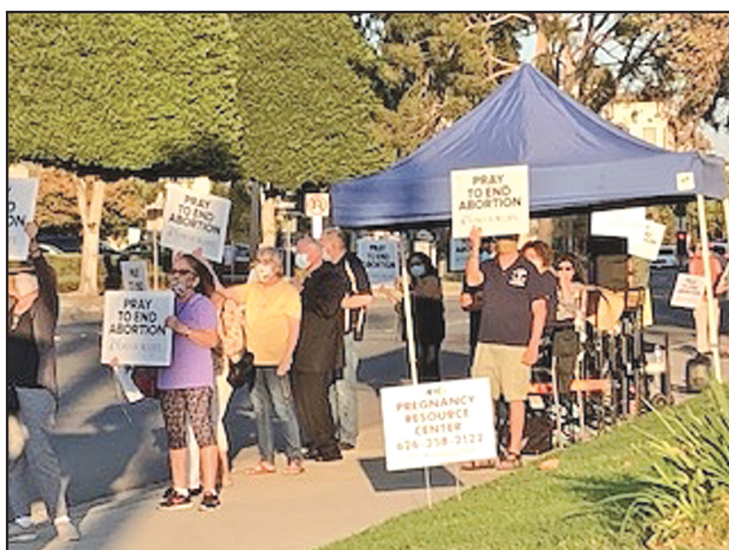
Participants standing outside the Planned Parenthood at the corner of Route 66 and Glendora Avenue in Glendora.

poor. The rally-goers acknowledged both the positive responses and the occasional middle finger with friendly waves.