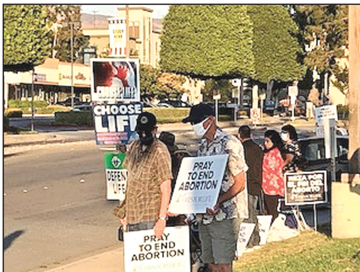
Participants standing outside the Planned Parenthood at the corner of Route 66 and Glendora Avenue in Glendora.

Passing drivers were mostly supportive, with lots of honks and thumbs up, although the gathering dusk made visibility