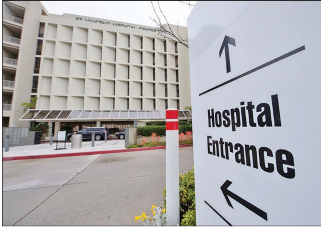
The Los Angeles Surge Hospital will be located on the campus of the former St. Vincent Medical Center in central Los Angeles.

Last month, under his Declaration of State Emergency and Executive Order, Governor Newsom authorized the leasing of facilities to respond to the COVID-19 pandemic, including the recently closed St. Vincent Medical Center. The hospital will create additional inpatient capacity in the community to treat the expected surge of patients with COVID-19 in the coming weeks. The facility will operate as a dedicated referral hospital and will not have an emergency room or accept walk-in patients. The County of Los Angeles' Department of Health Services will play