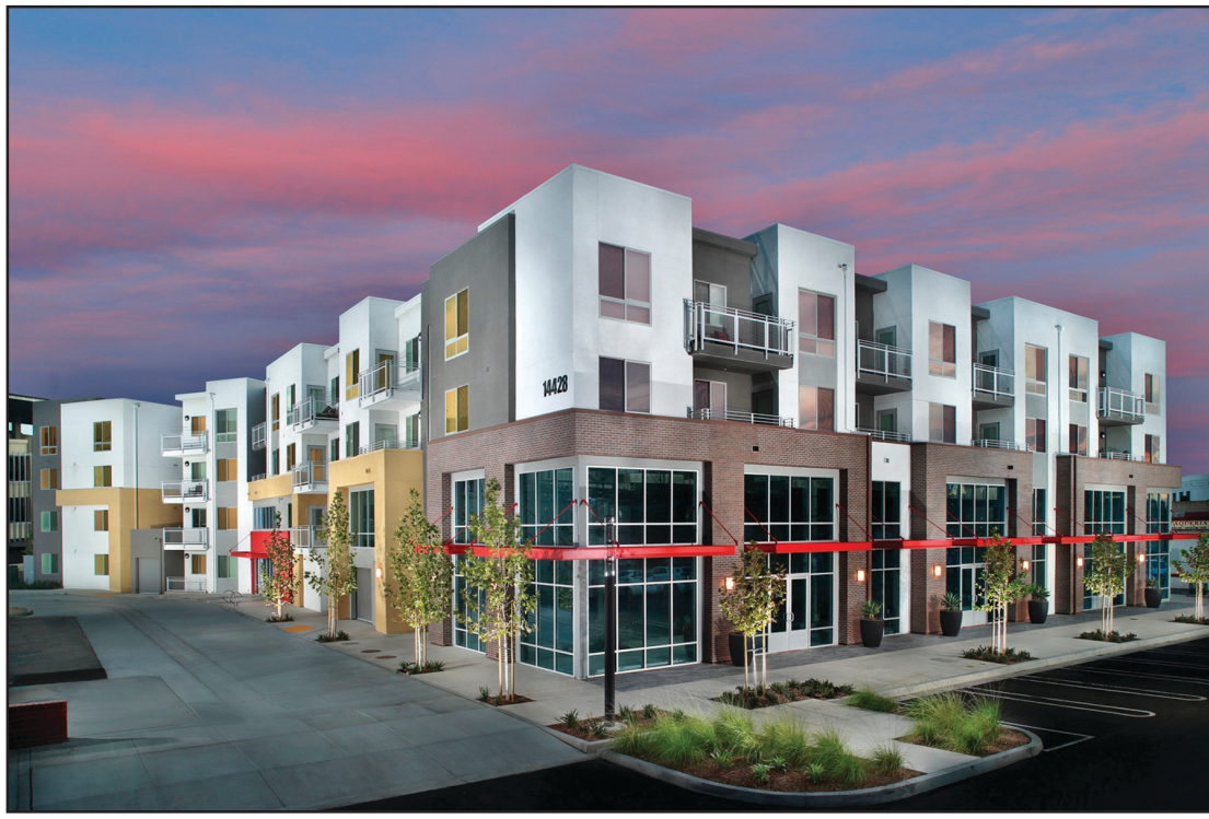
Mixed-use 70-unit residential community for low-income families opens in Los Angeles County

“The solutions to providing high-quality affordable housing are as diverse as the communities they serve and Metro Village is an excellent example,” said