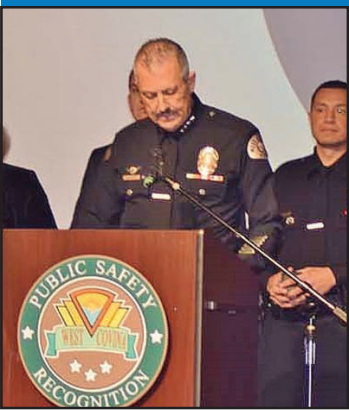
Police and Fire Personnel / 23