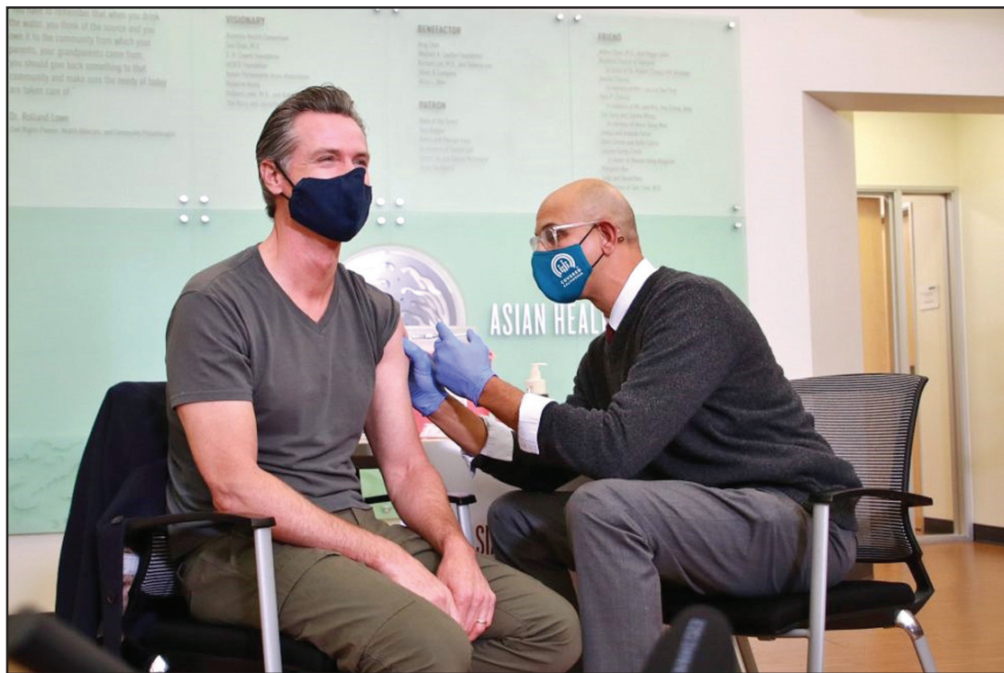
Governor Newsom receives COVID booster in Oakland.

OAKLAND - Following the FDA's Emergency Use Authorization approval for COVID-19 booster doses, Governor Gavin Newsom on Oct 27, 2021 received a Moderna vaccine booster at an Asian Health Services' clinic in Oakland's Chinatown, encouraging eligible Californians to get their booster and keep immunity strong, especially as we enter the winter months.